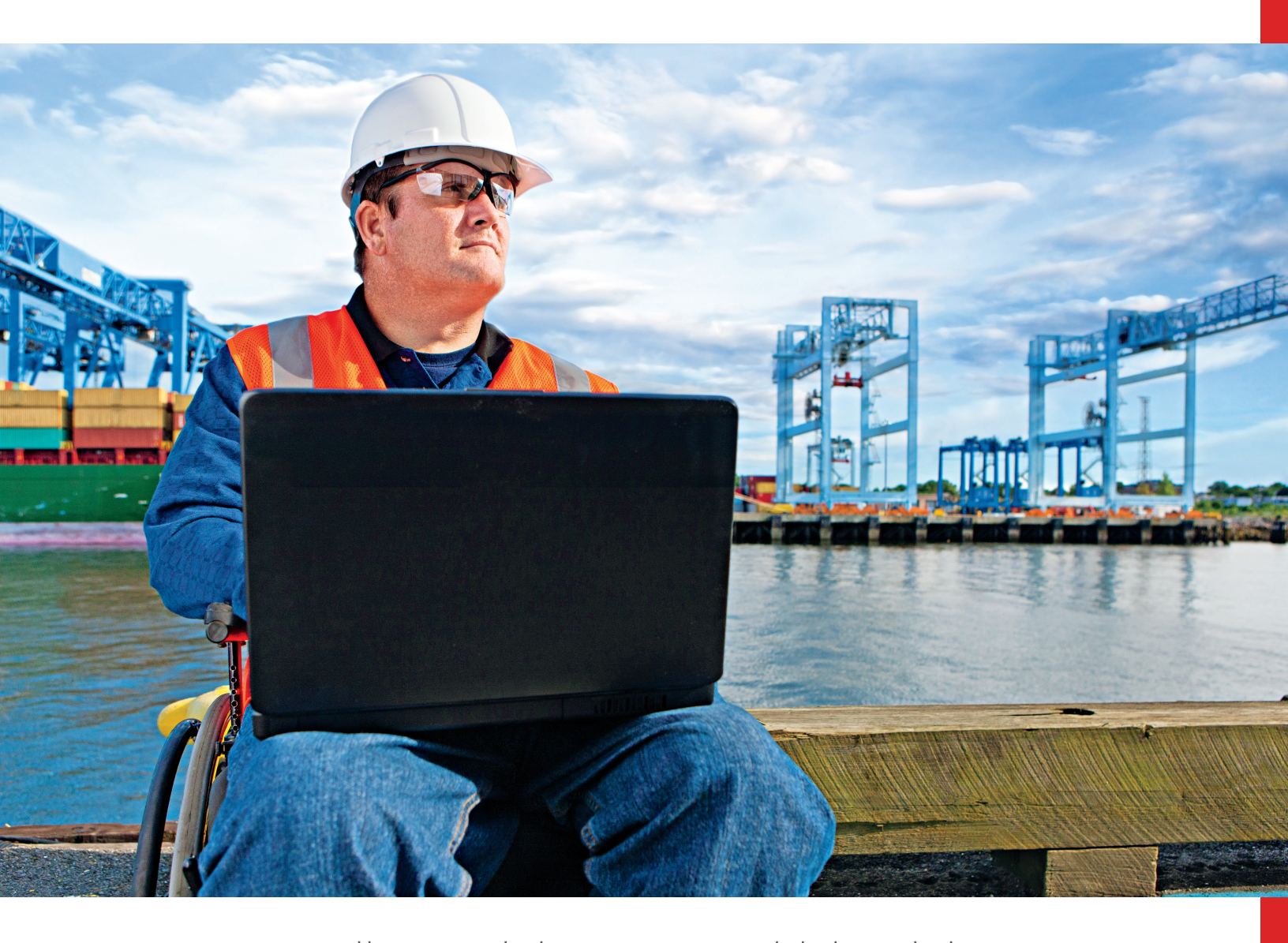
To all your abilities, now add the ability to save.